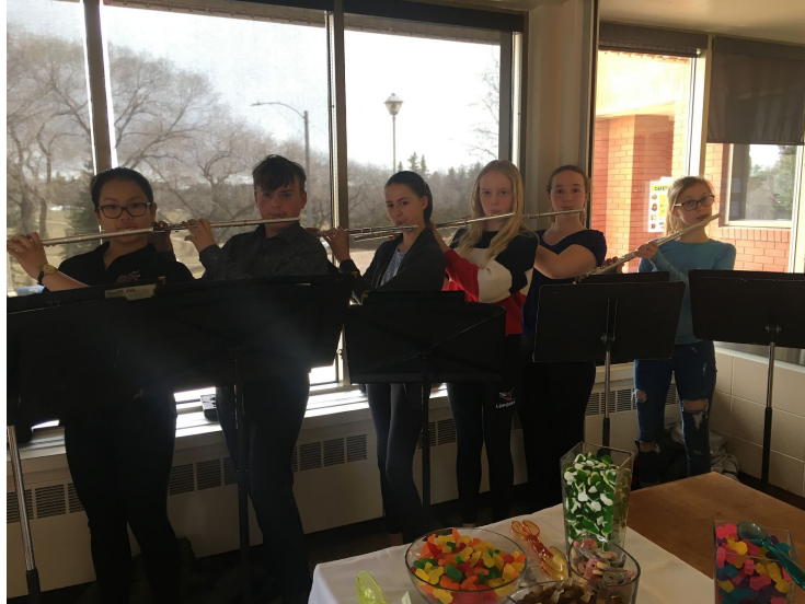
The ÉCKS flute ensemble performs at the St. Mary's Hospital Tea